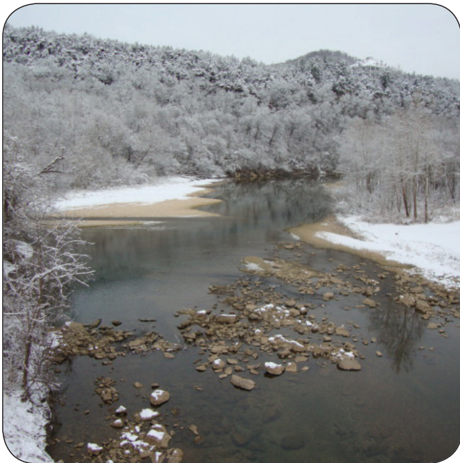
District 5: This snow scene comes from Sylamore Creek on Highway 14, west of Allison in Stone County.